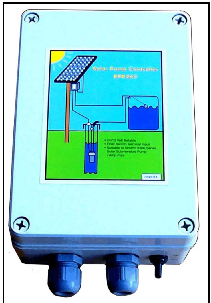
Cat. # REG-111 (instructions overleaf)