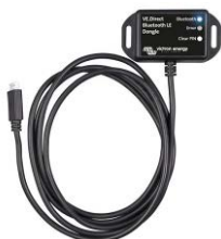
VE.Direct Bluetooth Smart dongle (must be ordered separately)

An excessively high or low battery voltage is indicated by an audible and visual alarm, and a relay for remote signalling.