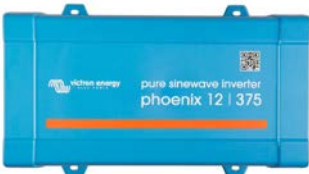
Phoenix 12/375 VE.Direct