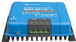
Solar Charge Controller MPPT 150/70-Tr