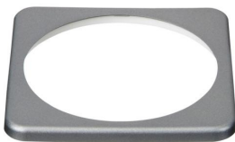
BMV bezel square