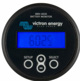
BMV 602S Black

(for all BMV models) Displays all information on a computer and loads charge/discharge data in an Excel file for graphical display.