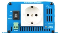
Phoenix Inverter 12/180 with Schuko socket