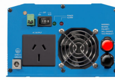
Phoenix Inverter 12/800 with AN/NZS 3112 socket